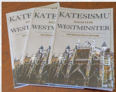
THE WESTMINSTER SHORTER CATECHISM.

Sometimes the work of overseas mission can be hard — very hard. However, sometimes in God's grace there are seasons where we experience the kindness of God in remarkable ways.