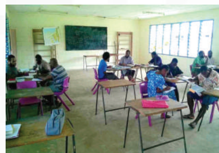
BMIN CLASS DISCUSSING THE PENTATEUCH.