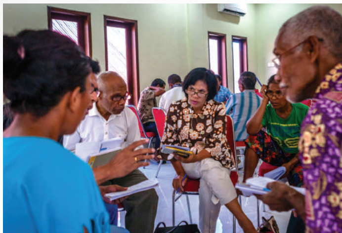
A SMALL GROUP DISCUSSING ROMANS.

We are now beginning to see the fruit of many years of hard work by the Evangelical Presbyterian Church of Timor Leste. However this is a ministry that is always in need of extra funds especially for Bible translation. If you would like to give towards this need then please use the form on page 4 of this newsletter or contact the APWM office.