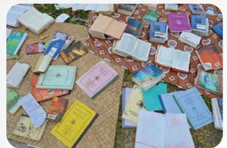
A PASTOR'S LIBRARY DRYING OUT

Just prior the arrival of Cyclone Pam I wrote to the Clerk of the Church in Vanuatu and said "I want to assure you of the prayers of the members of the Presbyterian Church of Australia for