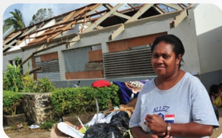
THE PRINCIPAL OF VILA NORTH SCHOOL OUTSIDE A BUILDING THAT HAS LOST ITS ROOF

As evidence of God's common grace, the Australian Government and many non-Government organisations such as the Red Cross, quickly put their standing