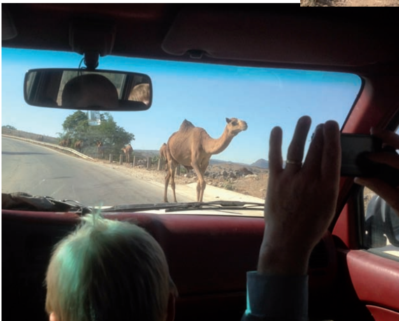
Top: Local lads near Lake Chad Middle left: Everybody wants a water buffalo! Middle right: We received a warm welcome, complete with artwork. Bottom left: Sharing the road with camels makes life interesting. Far left: Elephant rock in Chad.