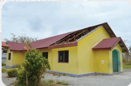
A CHURCH BUILDING IN A VILLAGE OUTSIDE EFATE, THE CAPITAL

Over the weekend 14-15th March Vanuatu was struck by Cyclone Pam, whose intensity exceeded the normal range for a category 5 cyclone. Such was the intensity of the