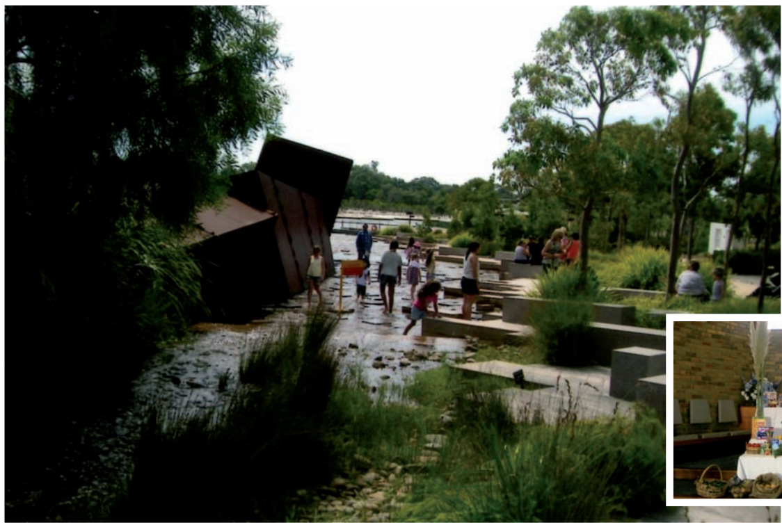
Left: Enjoying Cranbourne Botanical Gardens together.