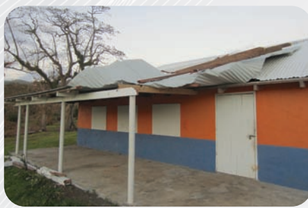
SOUTHERN ISLANDS PRESBYTERY BIBLE COLLEGE BUILT BY APWM WORKPARTIES

disaster relief plans into effect. This met the immediate need for food, water and shelter. When we run out of food in Australia we can easily go to the supermarket to re-stock. Many people in Vanuatu, however, rely upon their personal garden for their food, and