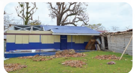
ETON VILLAGE PRESBYTERIAN WOMEN'S MISSIONARY UNION BUILDING