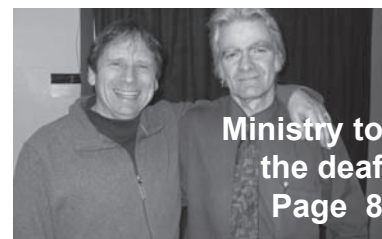
Ministry to the deaf Page 8

news from around the presbyterian church of victoria