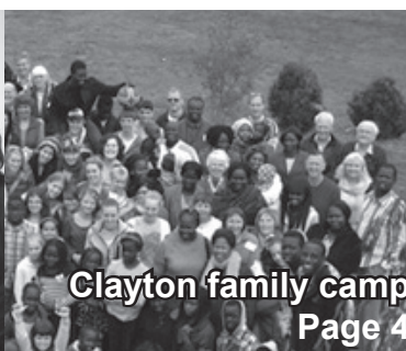
Clayton family camp Page 4