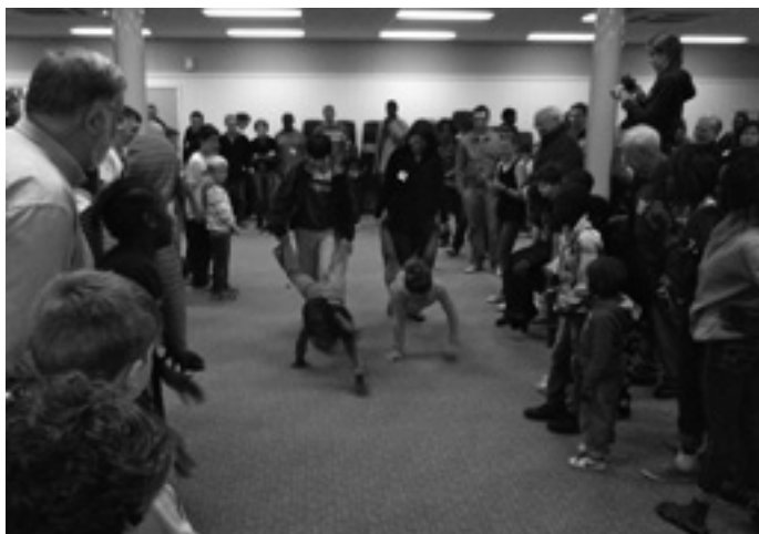
Younger campers proved their strength on family games night!