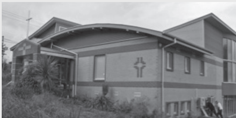
New and improved: the Heidelberg Presbyterian Church rebuilt after the fire

The old saying is: 'no news is good news'. With that thought in mind, you can usually sleep well at night. That is, until a phone call comes in the early hours of the morning, just when you don't expect it, for you are fast asleep.