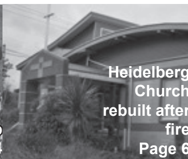
Heidelberg Church rebuilt after fire Page 6

Deadline for next FW edition: 1 Nov 2011