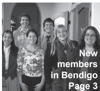
New members in Bendigo Page 3