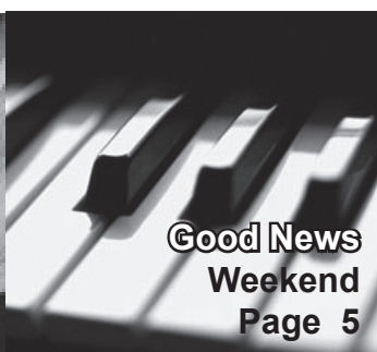
Good News Weekend Page 5