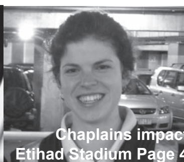
Chaplains impact Etihad Stadium Page 4