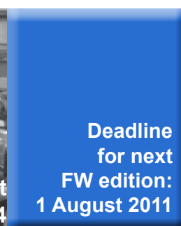
Deadline for next FW edition: 1 August 2011