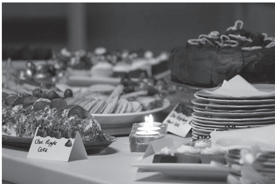
Some of the delicious food served at an evangelistic event for Warrnambool ladies