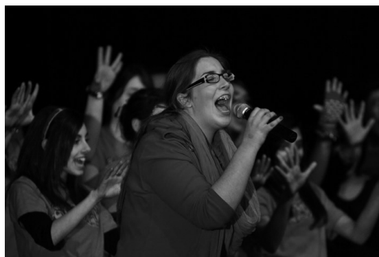
The 'Shebab' youth group from South Yarra won first prize for a performance that included singing, dancing, a violin, a skipping rope and basketballs!