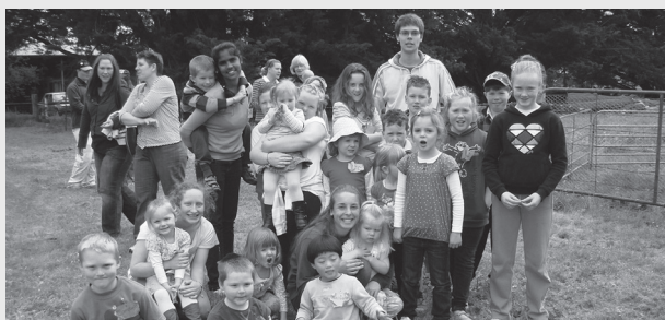
Kids at the Skipton Holiday Program with some of the team