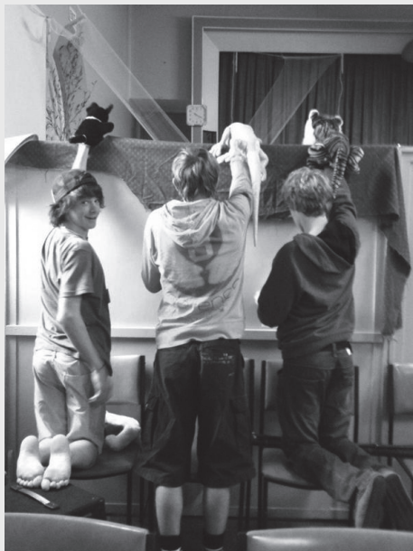
Performing with puppets at the holiday club!

If you are looking for a way to be challenged in your faith, to put your growing love for Christ into good works, and to be thrown completely out of your comfort zone... then I suggest getting involved in a short-term mission trip.