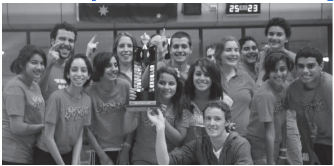
The winning cheer squad certainly earned their trophy!

Approximately 250 people from 19 Presbyterian churches across Victoria gathered on Saturday, March 27 for some volleyball action. PYV Volleyball has been a feature of the annual youth calendar for over a decade and this year was no exception with a large enthusiastic crowd!