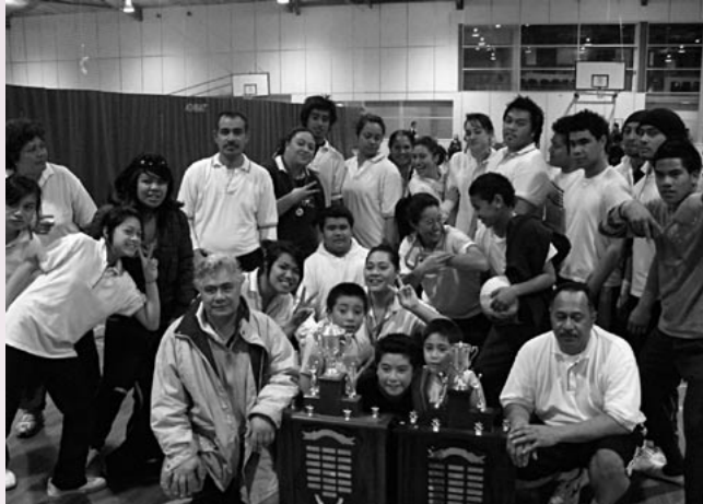
2008 PYV Volley ball Champions Fawkner Samoan

- The Fabulous Girl's Day Out, will be held on the 2nd August at the Canterbury Presbyterian Church. This day is an opportunity for the women of PYV to bring their friends to hangout, have a good time, and